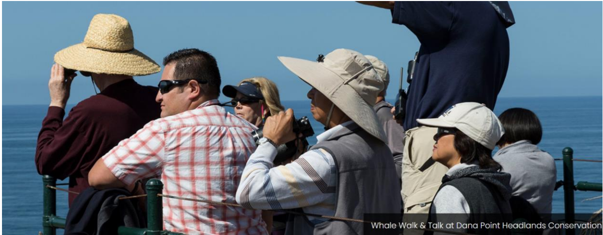
Whale Walk & Talk at Dana Point Headlands Conservation