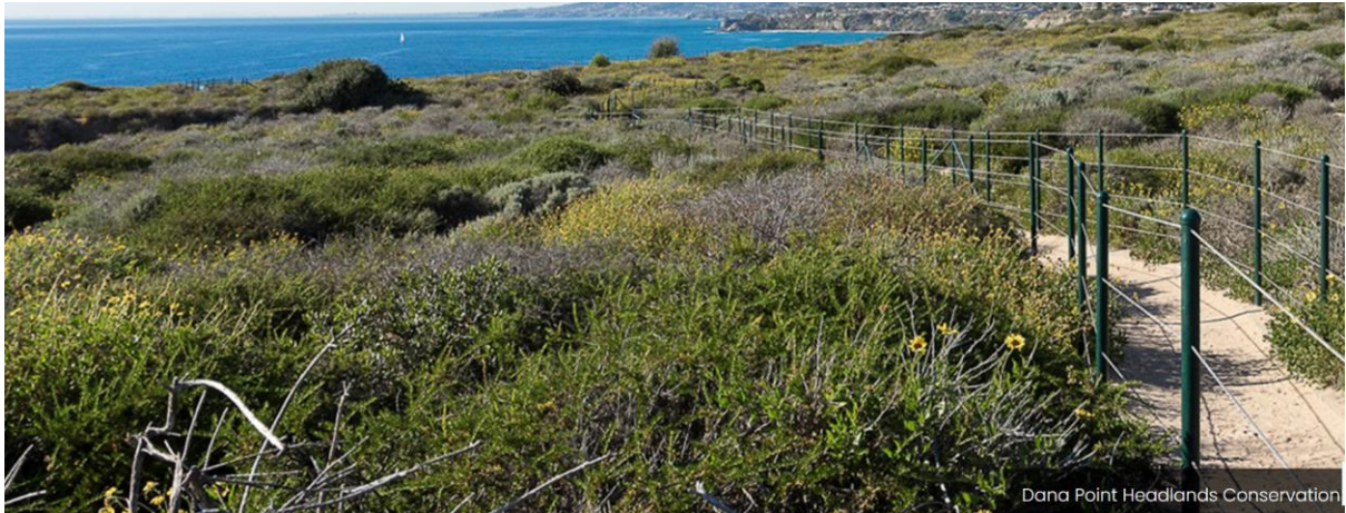
Dana Point Headlands Conservation