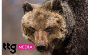
The Apennines Maronean Bear Heritage Area in Italy focuses on the critically endangered Maronean brown bear.

Agents are being encouraged to use a new free platform to help them discover responsible wildlife tourism experiences around the world to promote to clients.