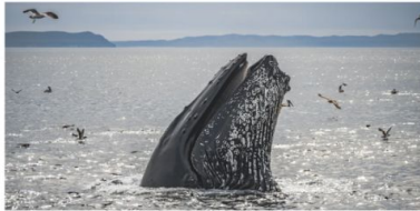
The Santa Barbara Channel Whale Heritage Area in California, an important migration route for gray and humpback whales, is among the newly designated Wildlife Heritage Areas.