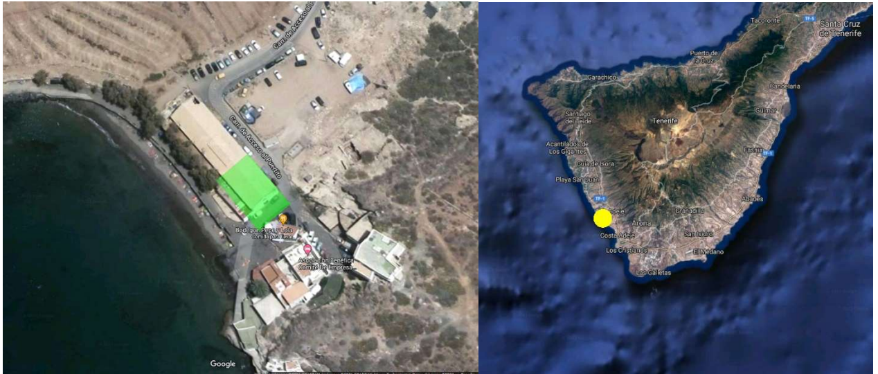
Location for the Cetacean Interpretation and Marine Wildlife Rescue Centre.

The project of Cuna del Alma is a new concept of sustainable holiday homes. The project is under construction, and it covers a long land plot, including waterfront land.