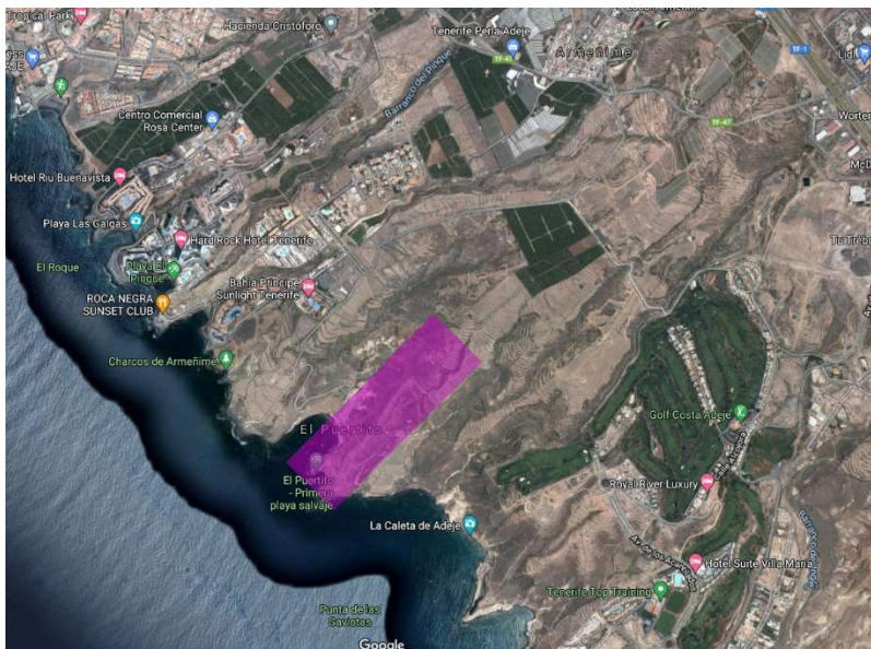
Cuna del Alma Project location.

The project of Cuna del Alma is a new concept of sustainable holiday homes. The project is under construction, and it covers a long land plot, including waterfront land.